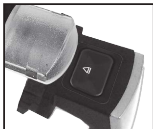
Basket Release Button (2)

The Sliding Button Guard helps to ensure you do not press the Basket Release Button by accident. Pressing the Basket Release Button causes the Outer Basket to separate from the Fry Basket and may result in injury if not done on a level, heat-resistant surface.